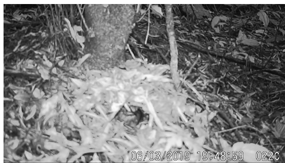
Fig. 1 The video screenshot showing that a hen Sichuan Partridge and its brood were roosting in their nest at night (data from Nest 201909)

Of 15 successful nests that were monitored, the homing behavior has been observed in 13 nests (Table 1). For all the 13 nests combined, the hens and their chicks returned to their nests at 18:49 p.m. \pm 40 min, and left at 07:00 a.m. \pm 36 min. The mean homing times after hatching were 6.7 \pm 4.3 nights (range = 1–15; n = 13 ). At this stage, the hens became very sensitive to the security of nest sites. If disturbed, whether by predators or human beings, they often abandoned the nests immediately and no longer returned thereafter.