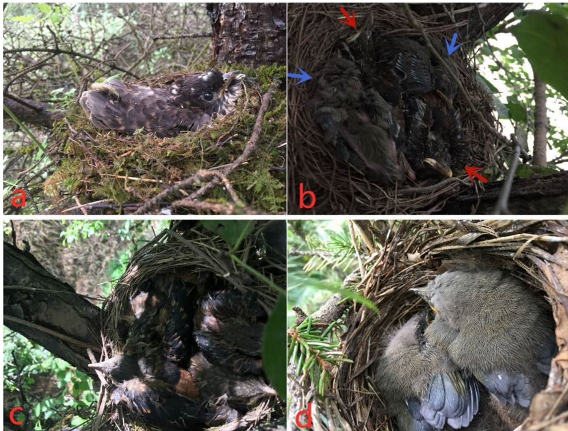
Fig. 1 Large Hawk Cuckoo nestling fed by Chestnut Thrush (a), Chestnut Thrush nestlings (red arrows) and two Elliot's Laughingthrush nestlings (blue arrows) fed by Chestnut Thrush (b), Chestnut Thrush nestlings fed by own parents (c), Elliot's Laughingthrush nestlings fed own parents

Since we observed no Chestnut Thrush nest parasitism by cuckoos in the study area from 2018 to 2019, we carried out cross-fostering experiments following the methods of Grim (2006b) and Grim et al. (2011). The nestlings of Elliot's Laughingthrushes and Large Hawk Cuckoos found in the nests of Elliot's Laughingthrushes were transferred to the nests of Chestnut Thrushes of the same nestling age so as to test the nestling discriminability of Chestnut Thrushes. We divided the experiments into four groups. In the first group, Chestnut Thrushes fed a Large Hawk Cuckoo nestling alone, with no other nestlings present (Fig. 1a). In the second group, Chestnut Thrushes fed two of their own nestlings and two Elliot's